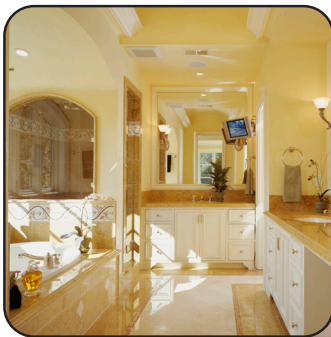
Bathrooms & Spas