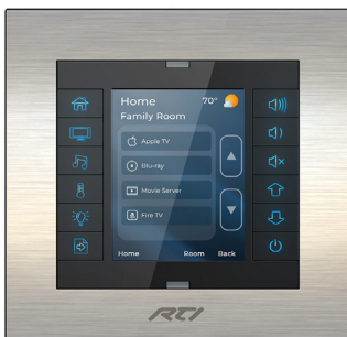
Brushed Aluminum Bezel