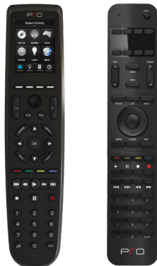
Compatible with both the Pro24.z (left) and iPro.8 (right) remote controllers.