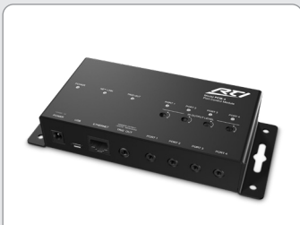
PCM-4 Port Control Module