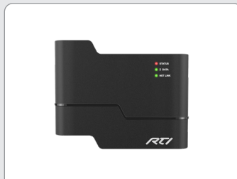
ZW-9 Z-Wave® Interface Module