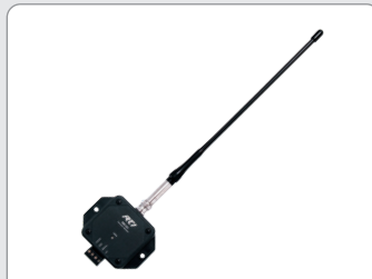
RM-433 433MHz RF Antenna