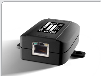
ESC-2 Ethernet to Serial Converter