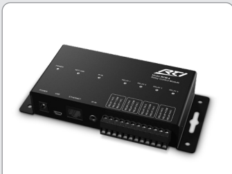
RCM-4 Relay Control Module