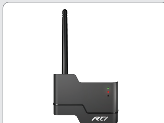
ZM-24 2.4GHz Zigbee® Transceiver